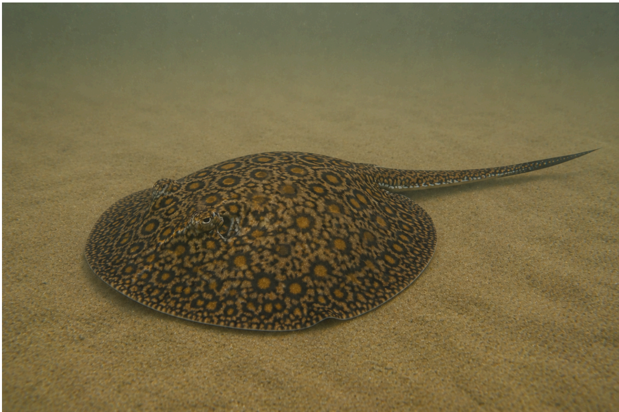
Figure 1: Freshwater stingray Potamotrygon motoro , showing the typical rounded body disc and spotted dorsal coloration.

In lentic environments, such as marginal lakes and floodplain areas, greater hydrodynamic stability and the accumulation of organic matter may favor higher food availability and muscle lipid deposition in fish. In contrast, species inhabiting lotic environments, which are exposed to greater swimming activity and energy expenditure, tend to show lower intramuscular fat accumulation. Studies on Amazonian fish have shown that specimens from lentic environments generally present higher total lipid and monounsaturated fatty acid contents, whereas individuals from lotic environments may exhibit leaner muscle, higher protein levels, and changes in the proportion of polyunsaturated fatty acids, especially EPA and DHA (Inhamuns et al. , 2009; Junk et al. , 2011; Souza et al. , 2023).