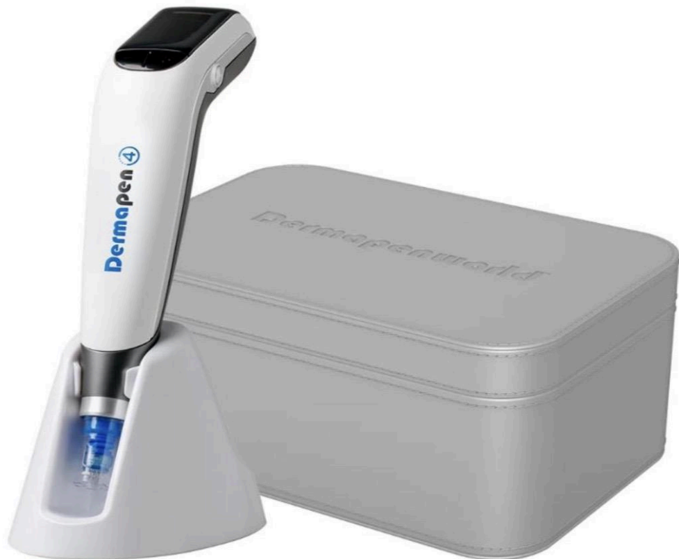
Image 2: Dermapenword 4 - (registrations: FDA-cleared (K510), CE Mark and TFDA)

Source: Dermapenworld.com. Available in: https://www.dermapenworld.com/en-rw/dermapen-professional/dermapen4-sos-kits . Access on 02 Apr. 2026